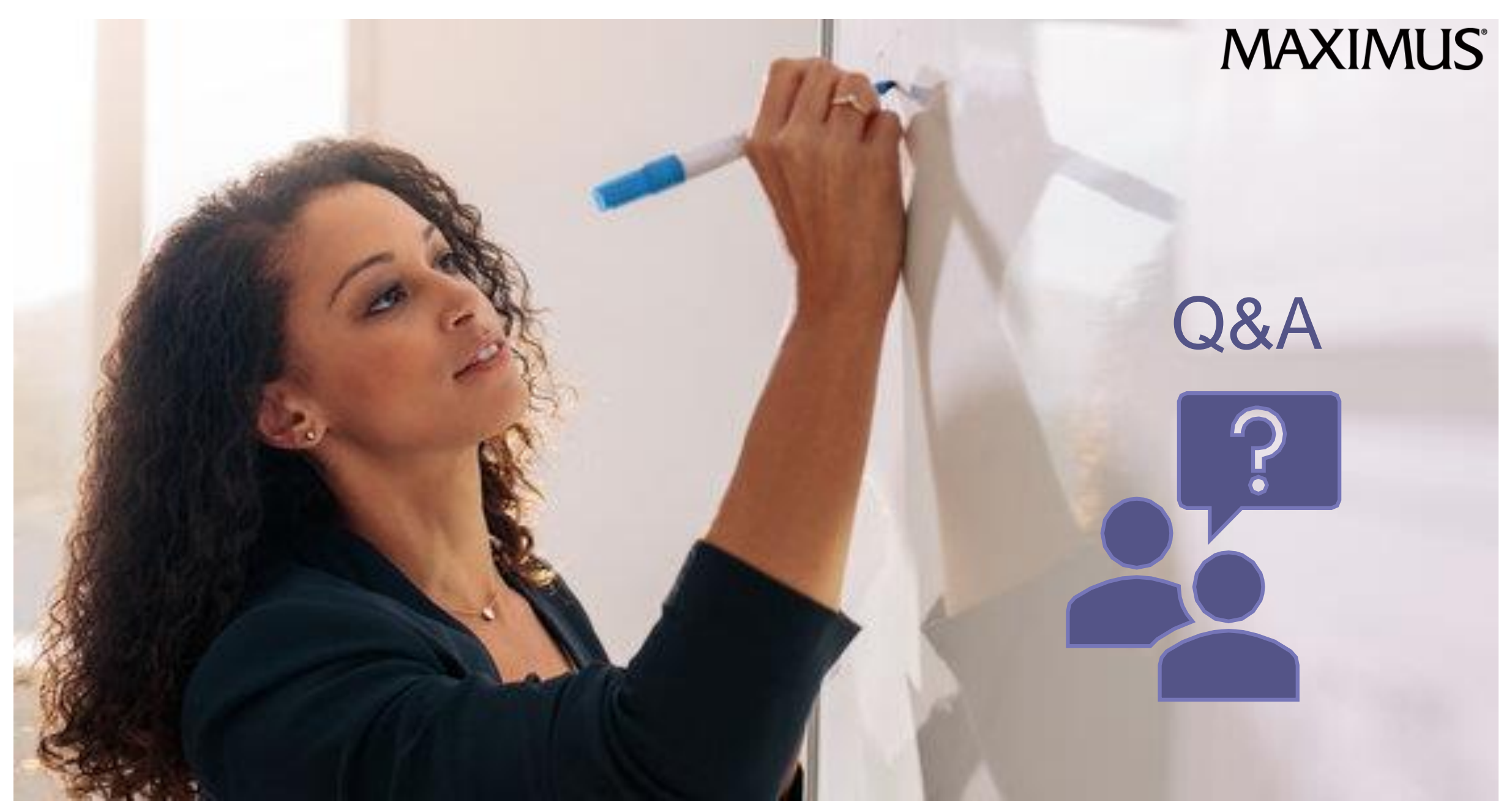
Video Interview - DC Job Placement